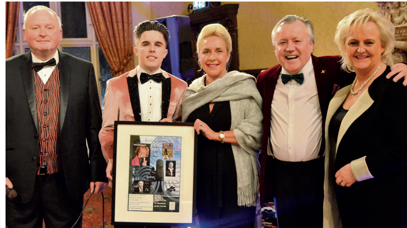
RECENT SHOW: Irish cabaret at Grim's Dyke Hotel in February this year