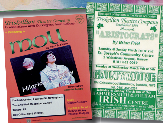
THE SHOW MUST GO ON: Posters for productions of John B Keane's Moll at the Nottingham Irish Centre and Brian Friel's Aristocrats at St Joseph's Community Centre in Harrow and the Galtymore