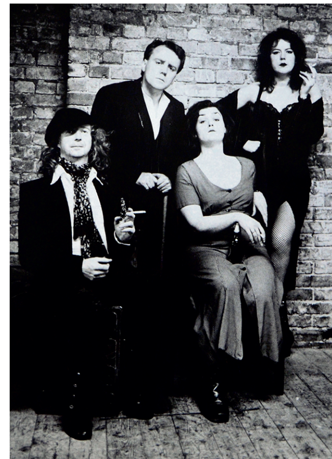
CAPTIVE AUDIENCE: The cast of The Hostage in 1996