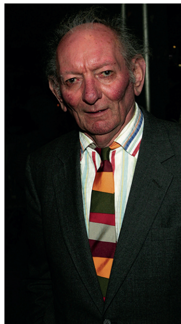
BRIAN'S BLESSING: A postcard from Brian Friel, left, waiving royalties to perform Philadelphia, Here I Come! for Cricklewood Homeless Concern (now Ashford Place)